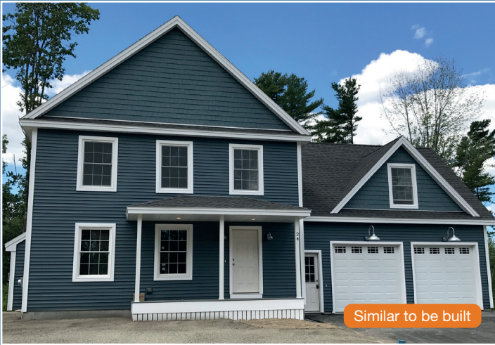
Similar to be built