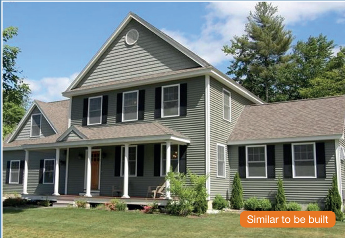
Similar to be built