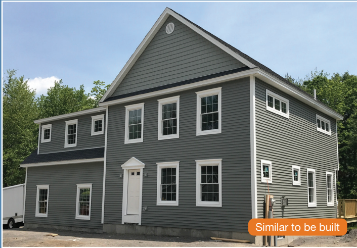
Similar to be built